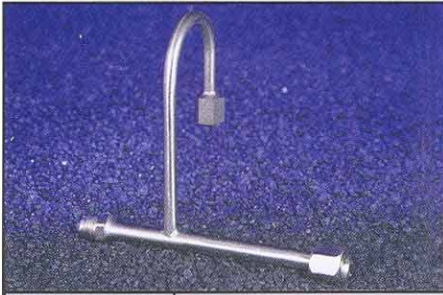
Safety Relief Adapter