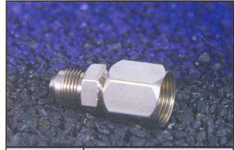
CGA Flare x CGA Female Flare