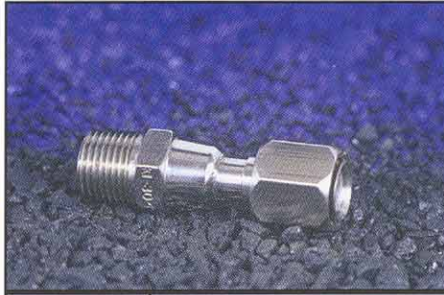
Male Pipe x CGA Flare